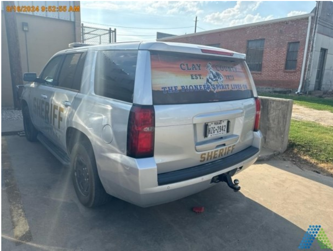
Document Name: LEFTREAR.jpg