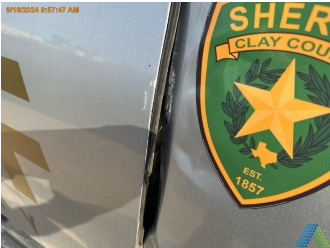
Document Name: RF DOOR(11).jpg