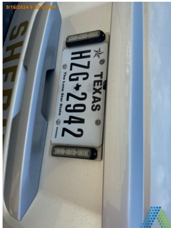
Document Name: LICENSE.jpg