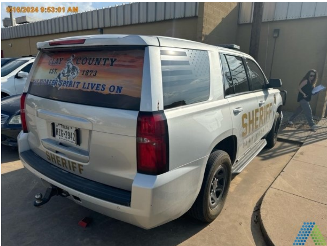
Document Name: RIGHTREAR.jpg