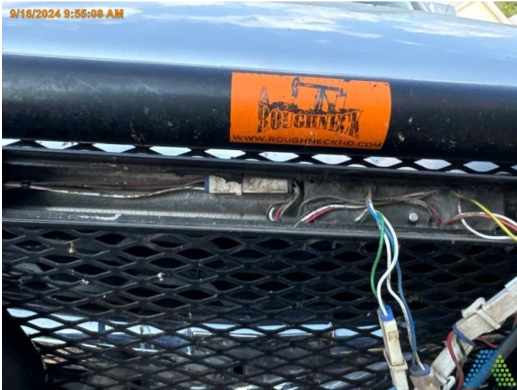
Document Name: GRILL GUARD BRAND(7).jpg