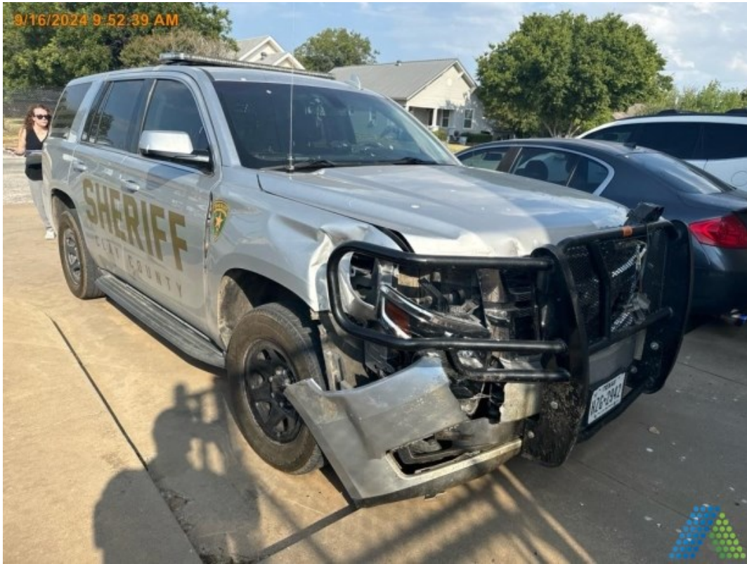
Document Name: RIGHTFRONT.jpg