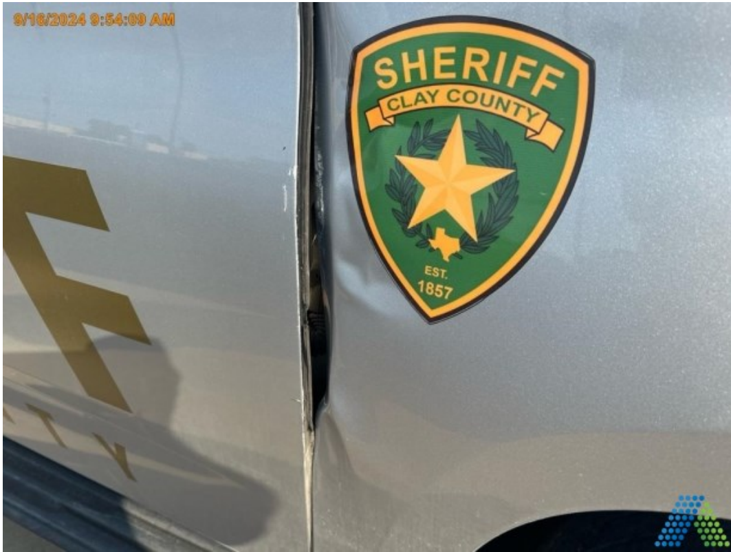
Document Name: RF DOOR AND FENDER(2).jpg