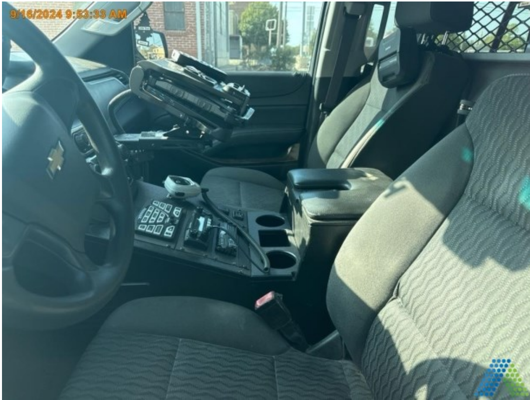
Document Name: INTERIOR.jpg