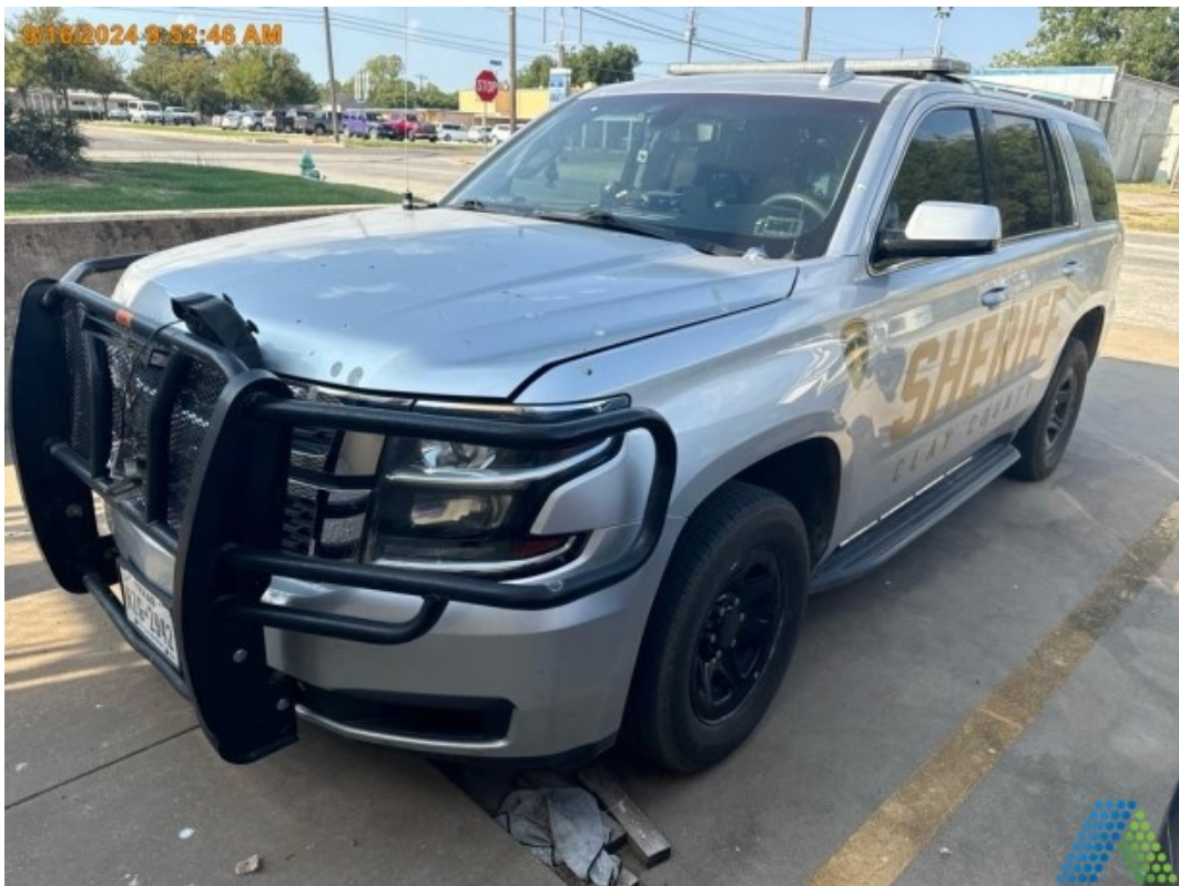
Document Name: LEFTFRONT.jpg