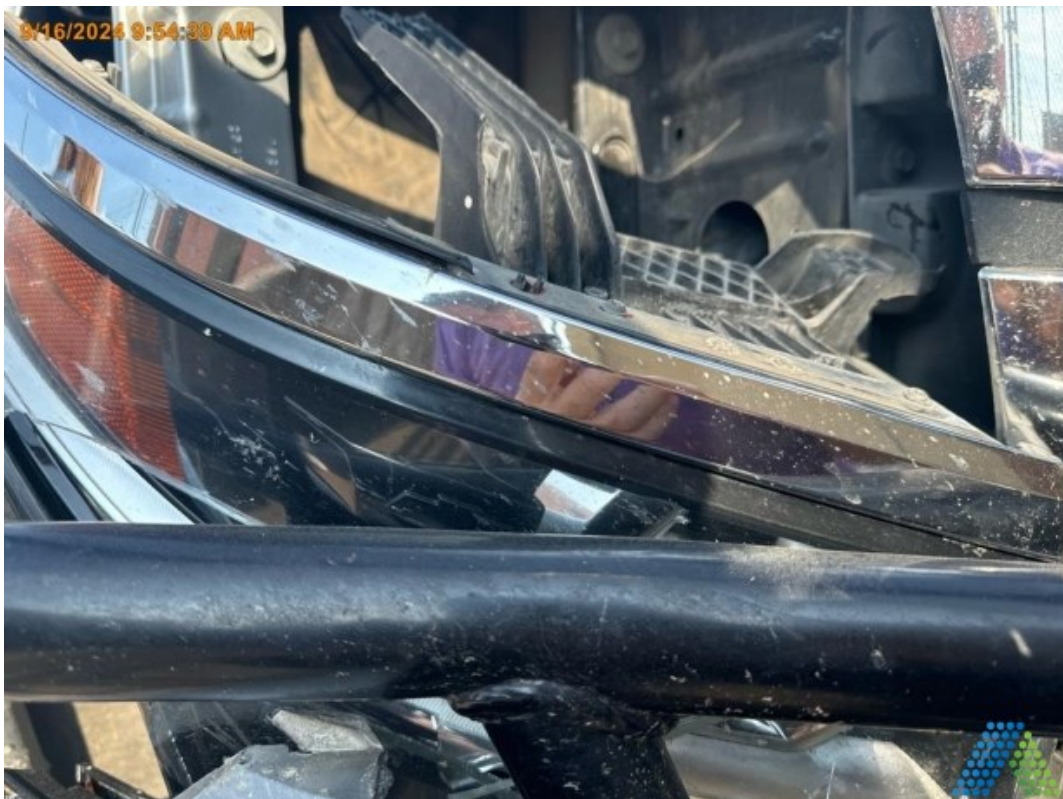
Document Name: RF LAMP (5).jpg