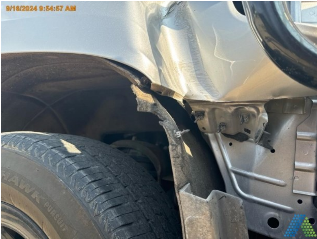
Document Name: RF INNER FENDER AND LINER(6).jpg